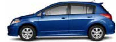
1.8 SL: HATCHBACK AND SEDAN