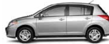
1.8 S: HATCHBACK AND SEDAN