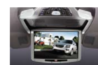
10" DVD entertainment system