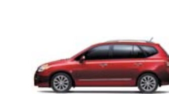
Bright Red - BC/BL