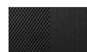
Black Cloth (BC)