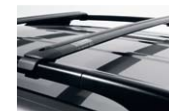
Roof rack crossbars