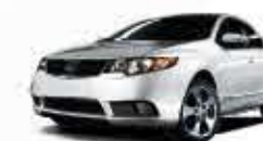
Pure White BC/BL