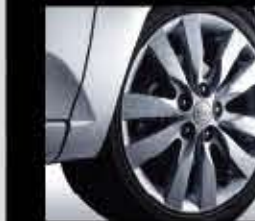
17" 10-spoke alloy wheels