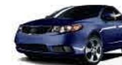
Electric Blue (M) BC/BL