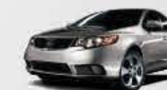
Titanium (M) BC/BL

BC = Black cloth, BL = Black leather, M = Metallic paint The exterior and interior colours in this brochure are as close to the actual vehicle production colours as the printing process allows.