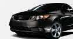
Black Orchid BC/BL