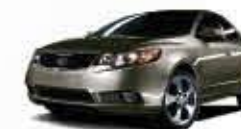
Bronze (M) BC/BL