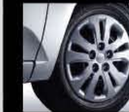
15" steel wheels with full covers