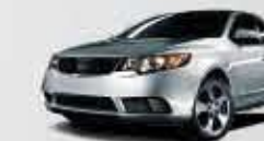
Sterling (M) BC/BL