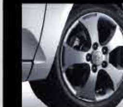
16" 5-spoke alloy wheels