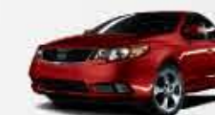
Radiant Red (M) BC/BL