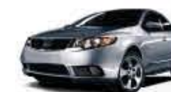
Smoky Grey (M) BC/BL