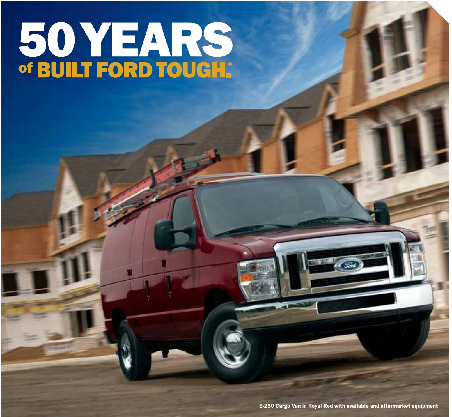
E-250 Cargo Van in Royal Red with available and aftermarket equipment