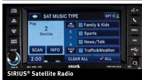
SIRIUS® Satellite Radio