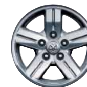
18-inch Chrome-clad cast aluminum wheel Available on SLT models