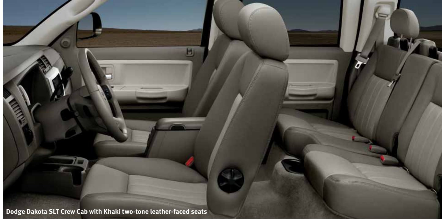
Dodge Dakota SLT Crew Cab with Khaki two-tone leather-faced seats