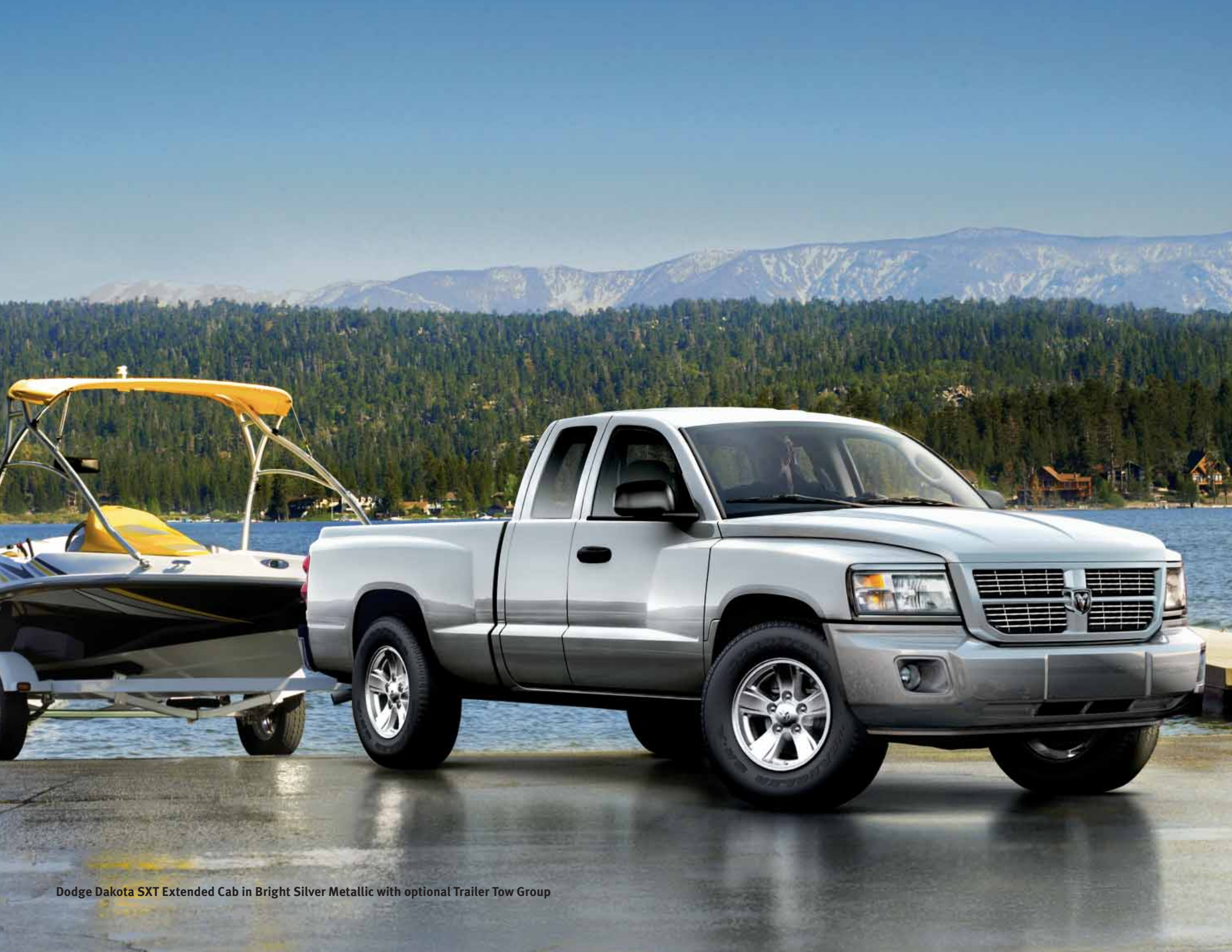
Dodge Dakota SXT Extended Cab in Bright Silver Metallic with optional Trailer Tow Group