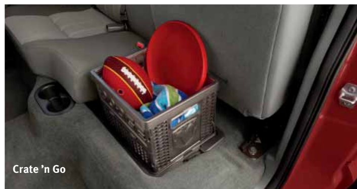
Crate 'n Go