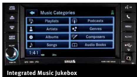
Integrated Music Jukebox