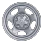
16-inch StyLED steel wheel Standard on ST models