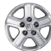
17-inch Cast aluminum wheel Available on SXT models