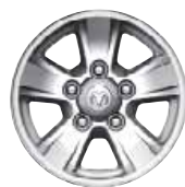
16-inch Painted cast aluminum wheel Standard on SXT models