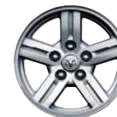
18-inch Painted cast aluminum wheel Standard on SLT