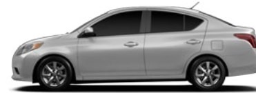
1.6 SL: CLASS AND TECHNOLOGY - UPSIZED