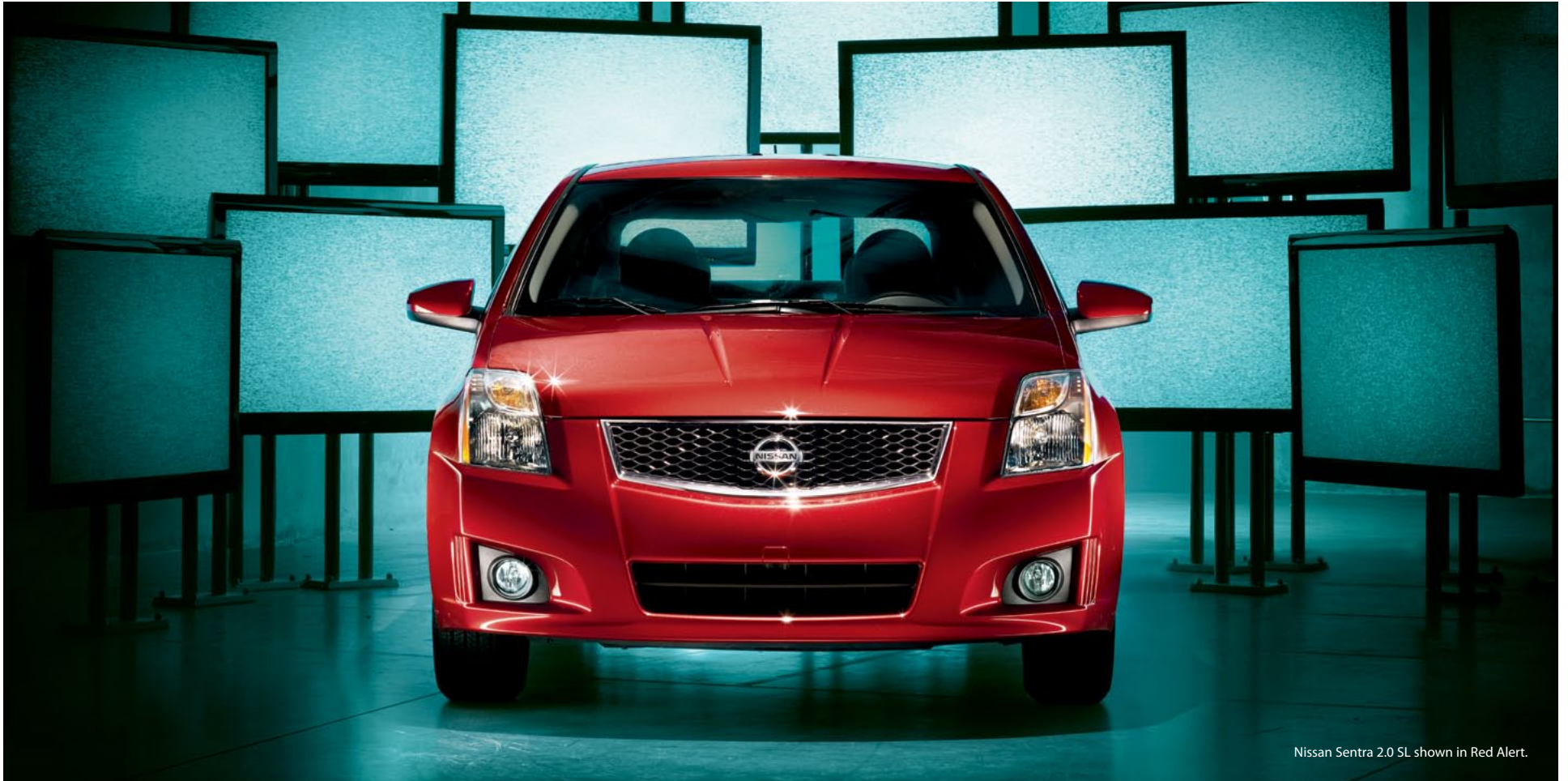
Nissan Sentra 2.0 SL shown in Red Alert.