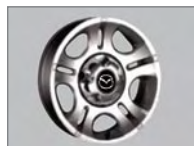
15" 5-spoke alloy wheels (SX Cab Plus)