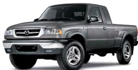
DARK TITANIUM METALLIC