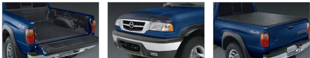
Pictured above from left to right: Bedliner - Under rail, hood deflector - Smoke, soft tonneau cover - Black vinyl.

For further information, please refer to the Mazda B-Series Truck Accessories Brochure. Mazda notes that all Genuine Mazda Accessories, if installed by your Mazda Dealer prior to or at an initial vehicle retail delivery, carry the same new-vehicle basic warranty as the Mazda B-Series Truck. Accessories subject to availability.