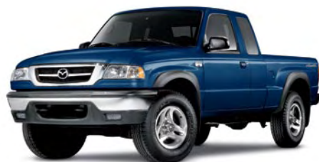
VISTA BLUE METALLIC