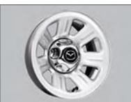
15" 7-spoke silver steel wheels (Regular Cab)