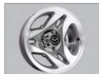
16" 3-spoke alloy wheels (SE 4x4)

MAZDA WARRANTY The basic warranty on the Mazda B-Series Truck covers all parts found to be factory defective for 3 years or 60,000 km, whichever comes first. Additional warranties cover powertrain components for a period of 5 years or 100,000 km, whichever comes first, body sheet metal perforation for 5 years and unlimited mileage and specific emission control components for up to 8 years or 128,000 km. Exclusions from coverage are limited to maintenance items or adjustments (repairs not requiring parts replacement) on vehicles over 12 months old and repairs due to normal wear and tear. Ask your Mazda Dealer for additional information.