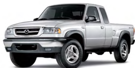
LIGHT SILVER METALLIC